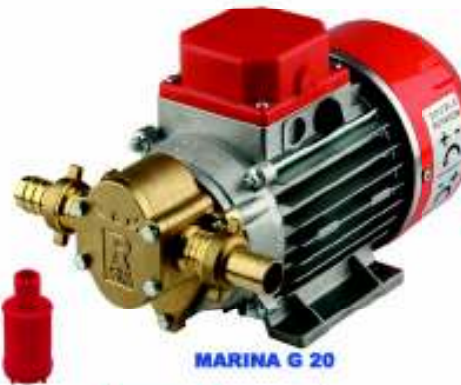
MARINA G 20